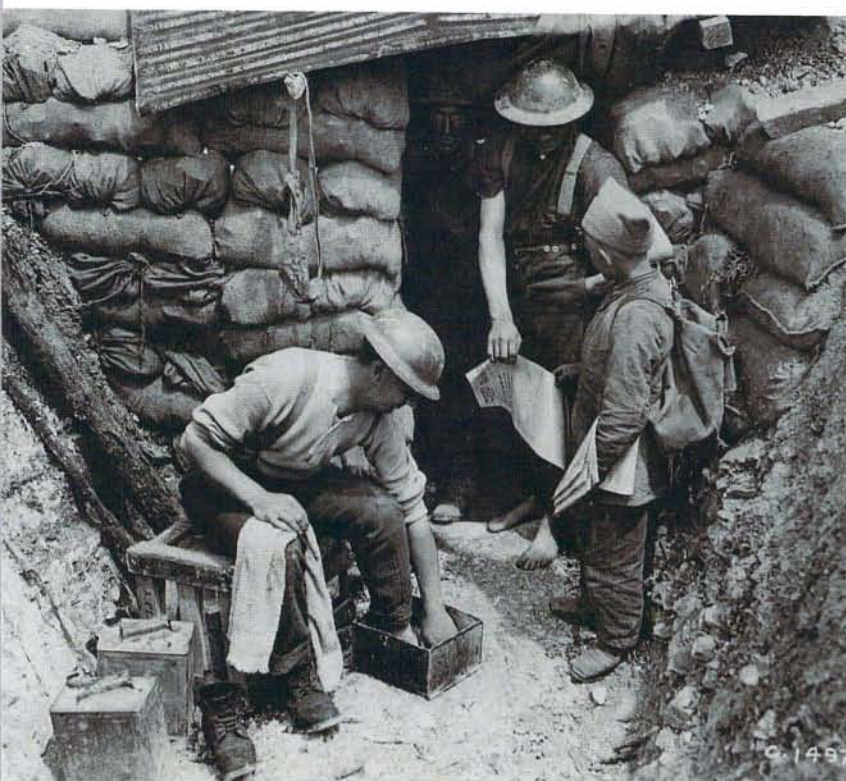
▲ A boy delivers a newspaper to men living in the trenches during World War I.