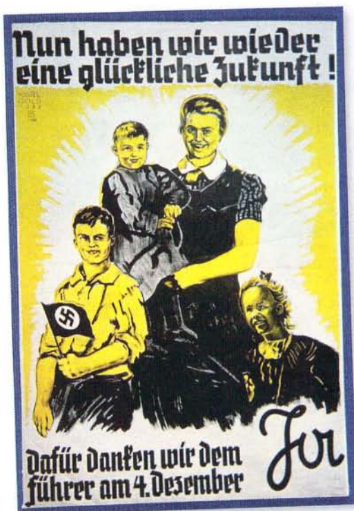
▲ This Nazi propaganda poster features a mother with her children. It says, "Now we again have a happy future. For that, we thank the Führer on December 4."