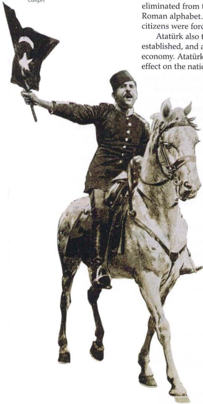
▲ The Young Turks rode through the streets of Turkey waving flags in 1908.