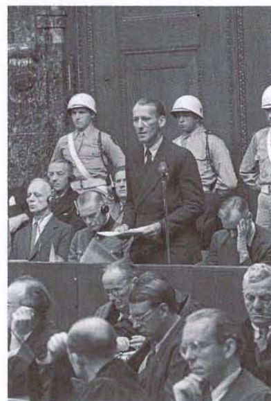
▲ Austrian SS chief Ernst Kaltenbrunner addresses the court during his trial for war crimes at Nuremberg.

Identifying Central Issues What was the major disagreement between the United States and the Soviet Union at the conclusion of World War II?