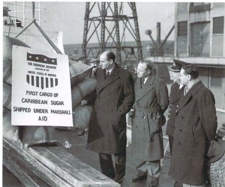
▲ Goods sent as part of the Marshall Plan arrive at Royal Victoria Dock in London, England, on February 3, 1949.

satellite state a country that is economically and politically dependent on another country