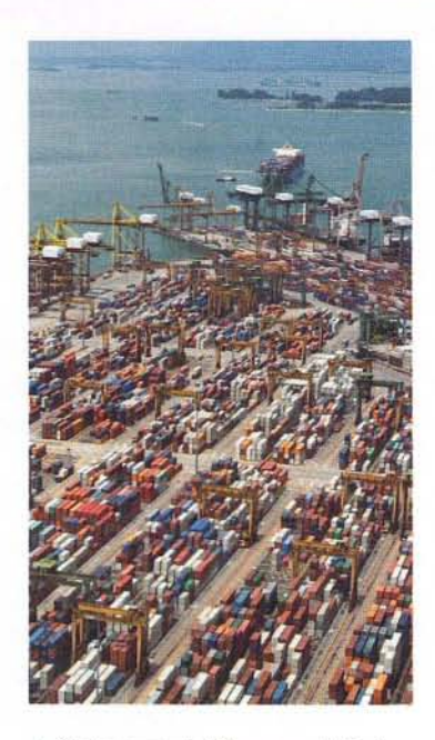
The busy port of Singapore, full of containers and container ships, is an international trading hub.

Comparing During the initial post-World War II period, in what ways were the "Asian tigers" similar?