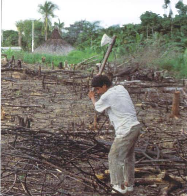
▲ A farmer clears an area of the Amazon rain forest.